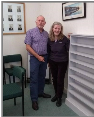
A CD shelf made for a community member

Celebrate it, and use it to broadcast the praises of your Shed, as you never know whose interest you may capture.