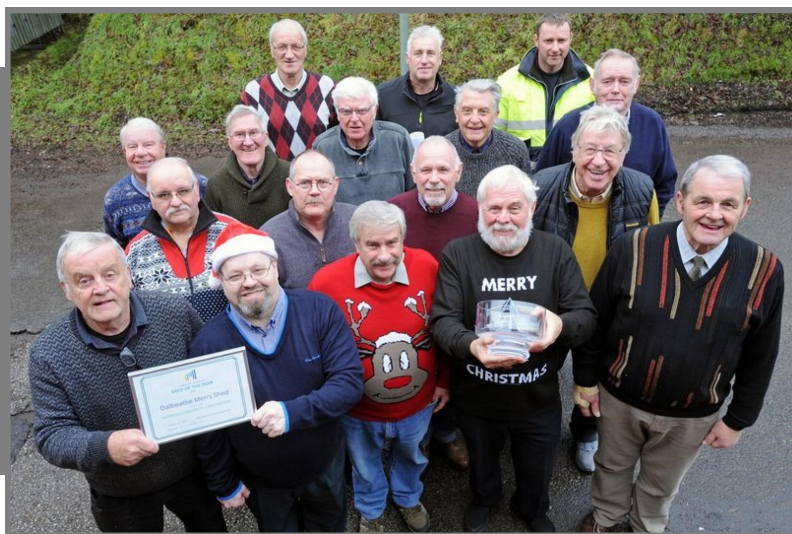
Dalbeattie Sheddors celebrating their award