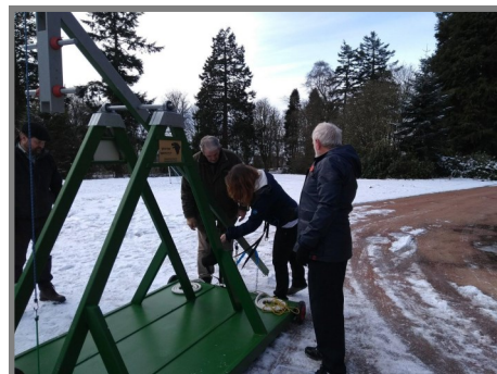
Dalbeattie Men's Shed delivering the Trebuchet to Wiston Lodge

We've also had more Sheds come from further afield visit and talk about setting up Men's Sheds in their communities. It's great being able to also influence the wider Sheds network and support and encourage it to continue growing from a grassroots level.