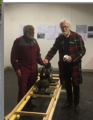
Billy Connolly visiting Dalbeattie Men's Shed

Nominations for Shed of the Year are now closed. Join us at ShedFest on Saturday 17th November to see who is awarded Shed of the Year 2018! Thank you to all of you who have submitted your nominations. For those of you who can't join us in Worcester next month, we'll announce the winners in December's Shoulder to Shoulder.