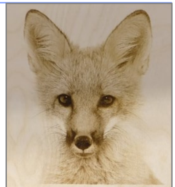
Laser Engraved Birch Faced Plywood