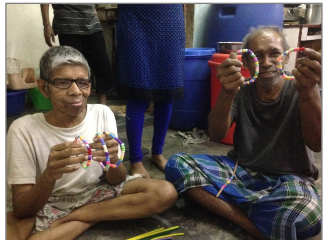
Residents proudly showing their crafts

To find out more about Friends of Kolkata Bhalobashi Foundation, visit bit.ly/2H79CpX