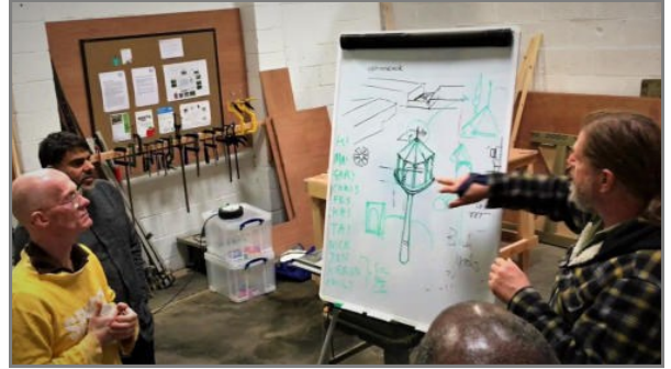
Moss Side Men's Shed, at The Boiler House