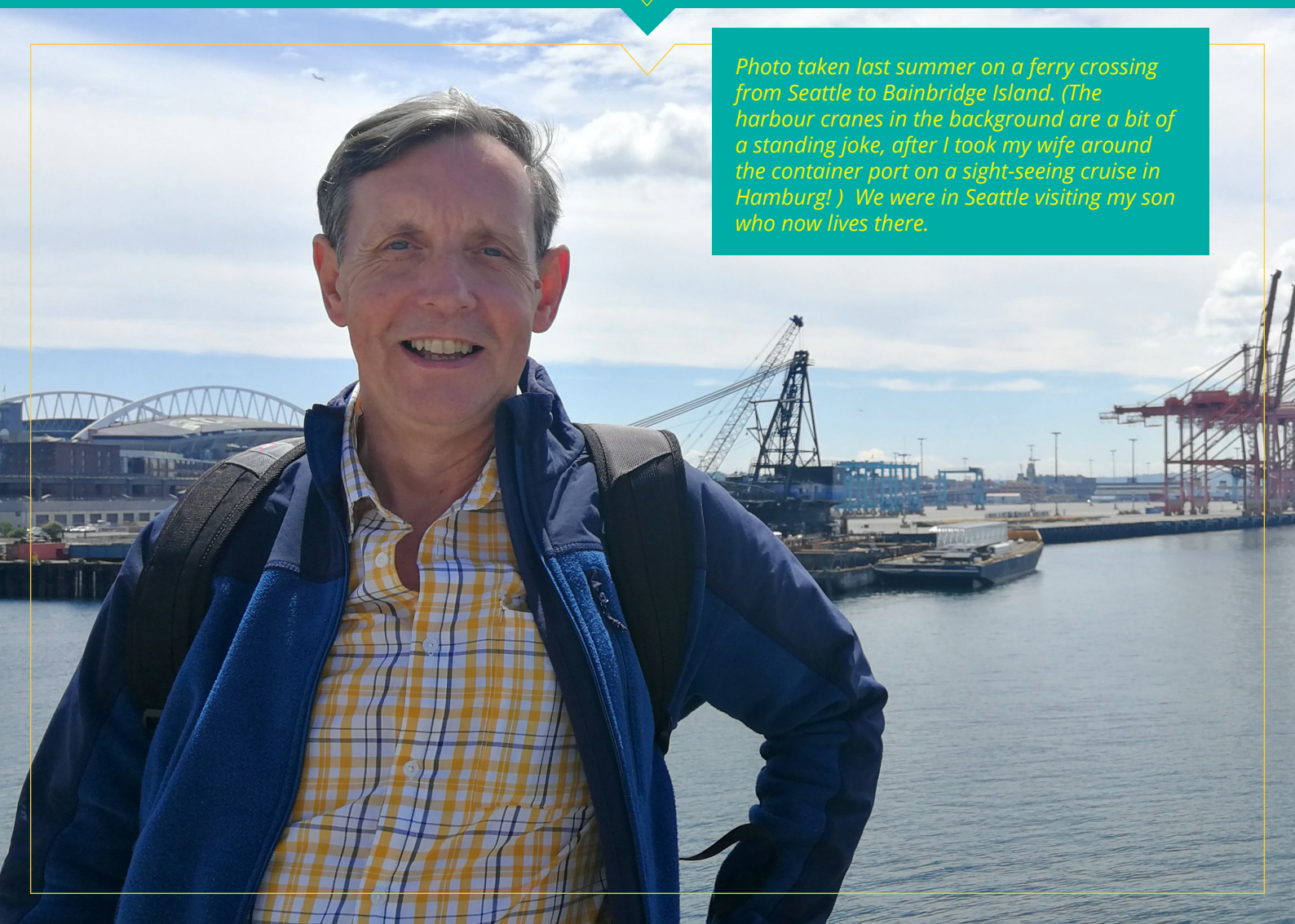
Photo taken last summer on a ferry crossing from Seattle to Bainbridge Island. (The harbour cranes in the background are a bit of a standing joke, after I took my wife around the container port on a sight-seeing cruise in Hamburg! ) We were in Seattle visiting my son who now lives there.

With around 550 Sheds now open across the UK, I think we are a long way from reaching the potential of the movement, there are many men living in cities, towns & villages who do not have access to a local Shed, so there is still plenty for UKMSA to do to support that growth.