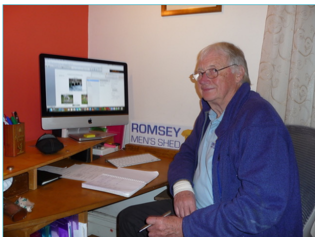
Online Weekly Meeting