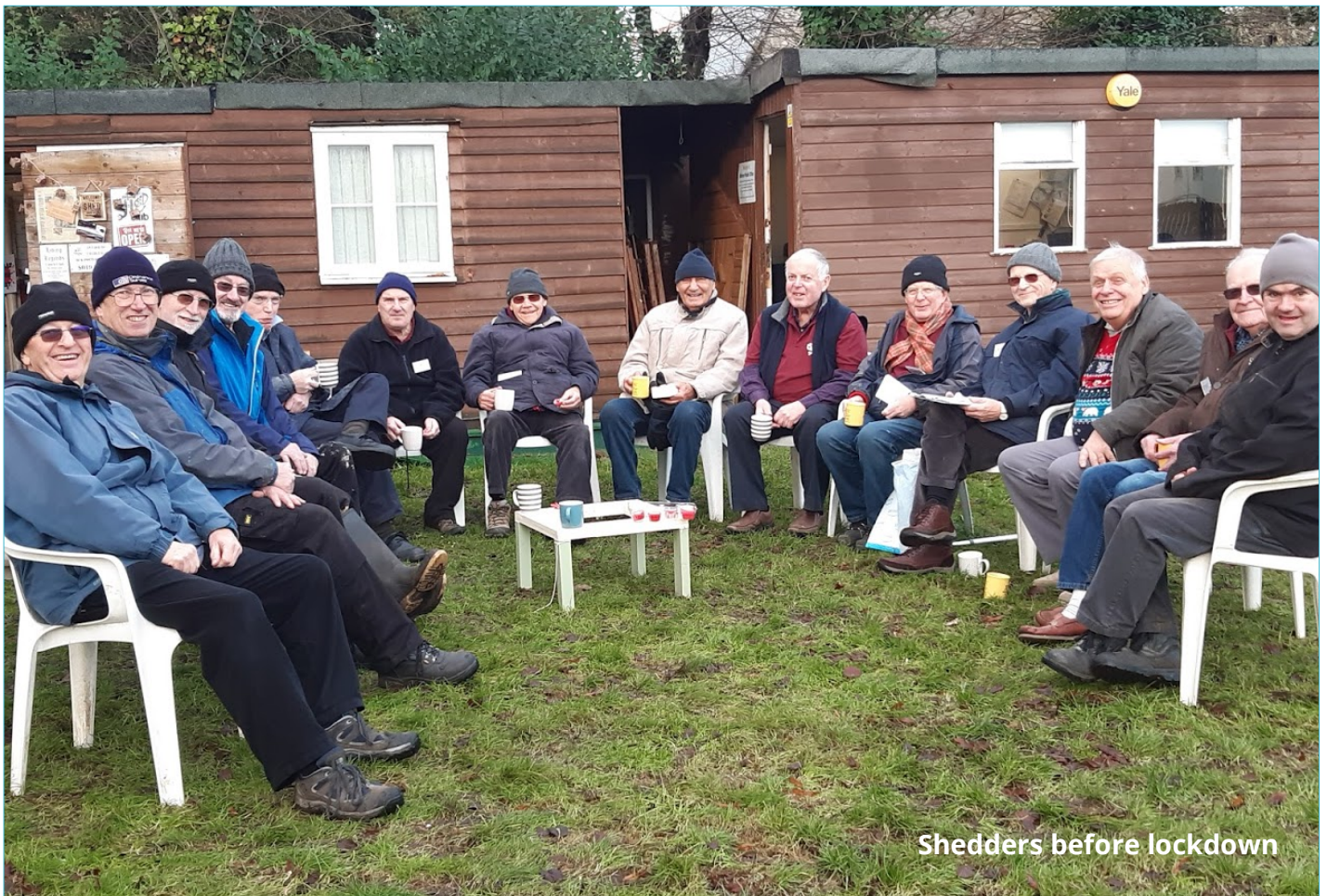
Shedders before lockdown